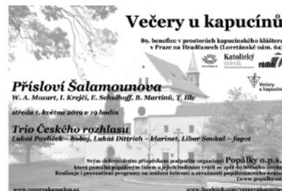
Benefice for Popálky Prague