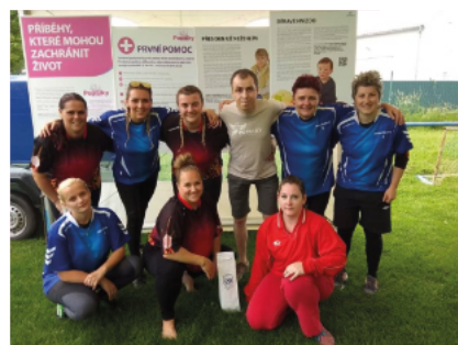
Firefighting competition in Ratíškovice