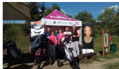
Benefit golf IMP net