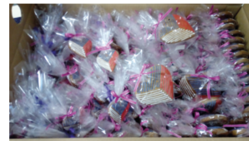
St. Nicholas gift from the company Požární bezpečnost s.r.o. yield for Popálky

Do you also want to take an active part in helping burn victims? Become our donor.