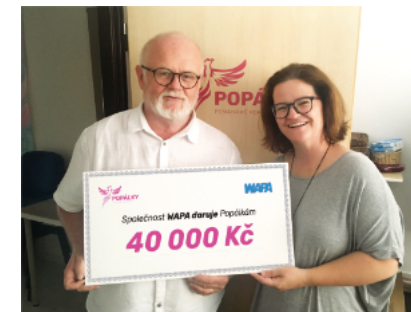
Handing over a check from WAPA s. r. o.