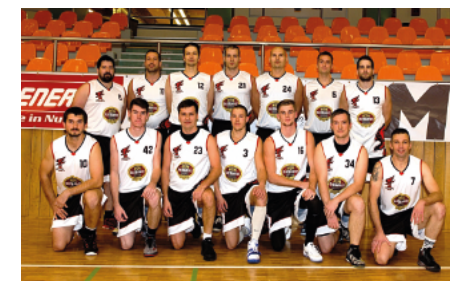
Contribution from TJ Sokol Hodonín