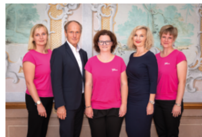
Handing over a check from Hettich ČR k. s. to CZK,13 500