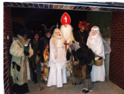
Donation of proceeds from Mikuláš of Ratíškovice